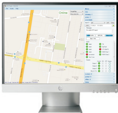
Window remote Desktop